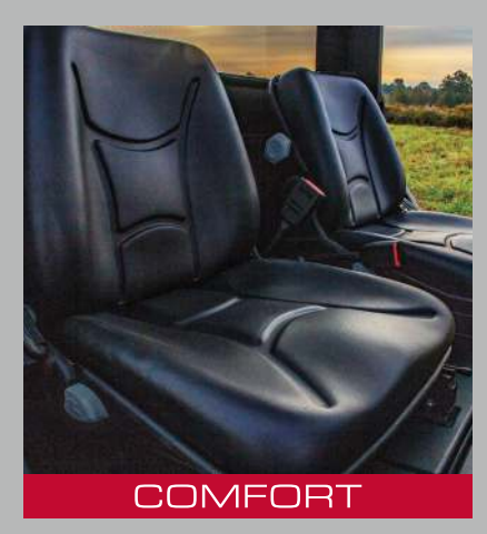
Built to provide ample space for its passengers, our seats come equipped with adjustable slide, tilt, and lumbar support.