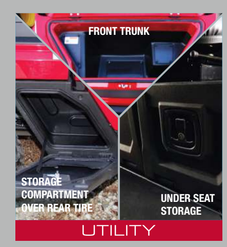
Comes with ample storage space for use in storing everything from tool boxes to hunting gear, including under-seat storage