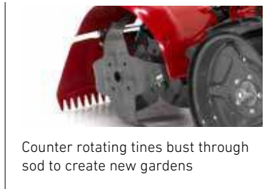
Counter rotating tines bust through sod to create new gardens