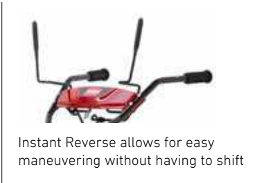
Instant Reverse allows for easy maneuvering without having to shift