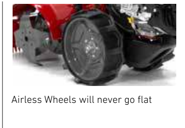
Airless Wheels will never go flat