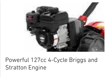
Powerful 127cc 4-Cycle Briggs and Stratton Engine